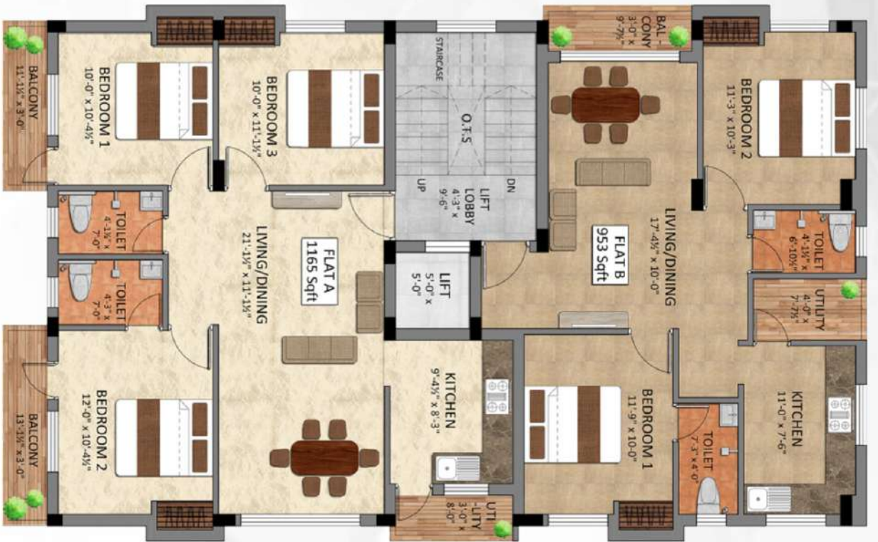
TYPICAL FLOOR PLAN ( 1st & 2rd Floor )